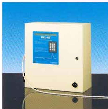
PAL-AT Leak Detection/Location System